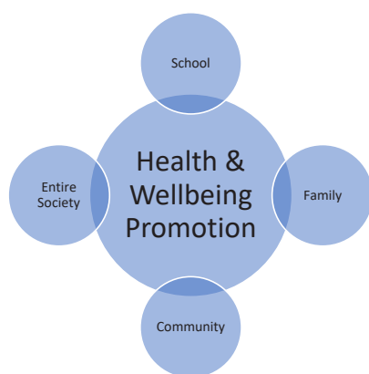
Figure 3. Stakeholders involved in Health and Wellbeing Promotion.

socio-emotional difficulties and risky behaviours (i.e. addictions to alcohol, tobacco, and drugs). Educators must encourage the adoption of healthy lifestyles and foster the development of critical thinking towards unhealthy behaviours and their physical, psychological and social consequences. 60