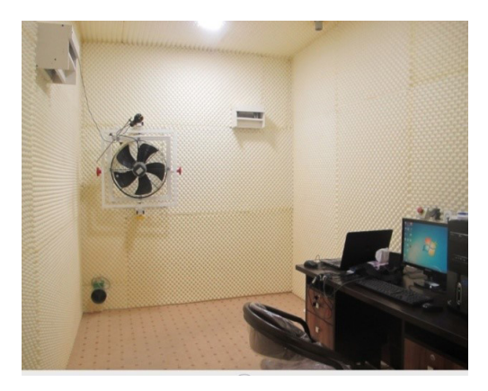
Figure 1. Experimental setup in Air conditioning chamber.

work with the N-back software.<sup>28</sup> All of the people were working while sitting and the order of doing the job was from low to high workload. The participants in this study were required to wear ordinary clothes such as shirts, pants, underwear, socks and shoes. The air temperature was also under controlled conditions (in different stages of the experiment) with the constant relative humidity of 50% in all conditions and the air flow rate of 0.15 m/s. Each task lasted for 5 minutes and each stimulus was displayed for 2500 ms. There were 120 stimuli at all levels of task executed during exposure to different air temperatures (Figure 2).