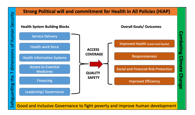
Figure 3. The essential four critical dimensions to reinforce the WHO's health system building blocks.

According to our knowledge, this systematic review is the first of its kind in this interdisciplinary area of politics, health, and diplomacy in the African context. Secondly, the review has taken into consideration all the published literature and the authentic grey literature